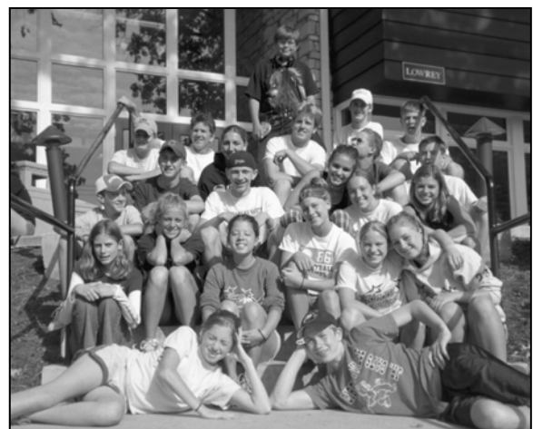
Peer Leadership Camp at Lake Geneva, July 2004

Peer Leadership Groups will be meeting throughout the school year, creating many more relationships, memories and life long skills! Way to go North Star Peer Leadership!